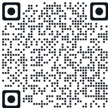
Luoran Facebook Group