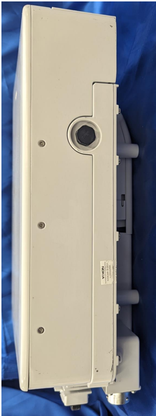
Right Side AWKUC/D (Base Unit)