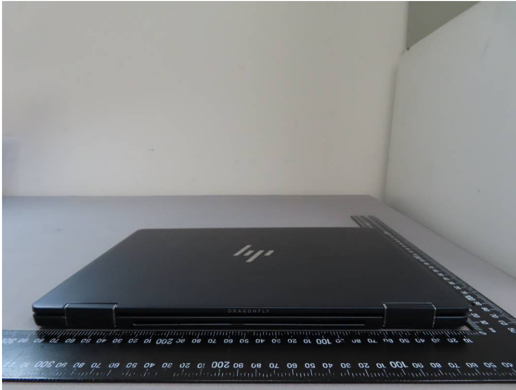
Side View of EUT – 5

Unless otherwise stated the results shown in this test report refer only to the sample(s) tested and such sample(s) are retained for 90 days only.