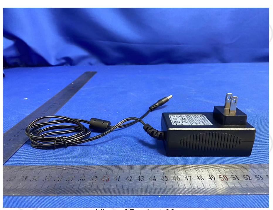
View of Product-22