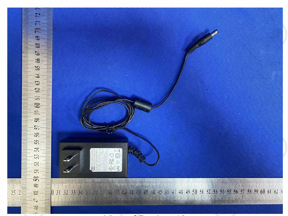
View of Product-18