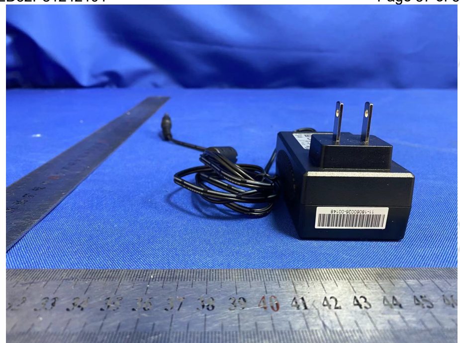
View of Product-21