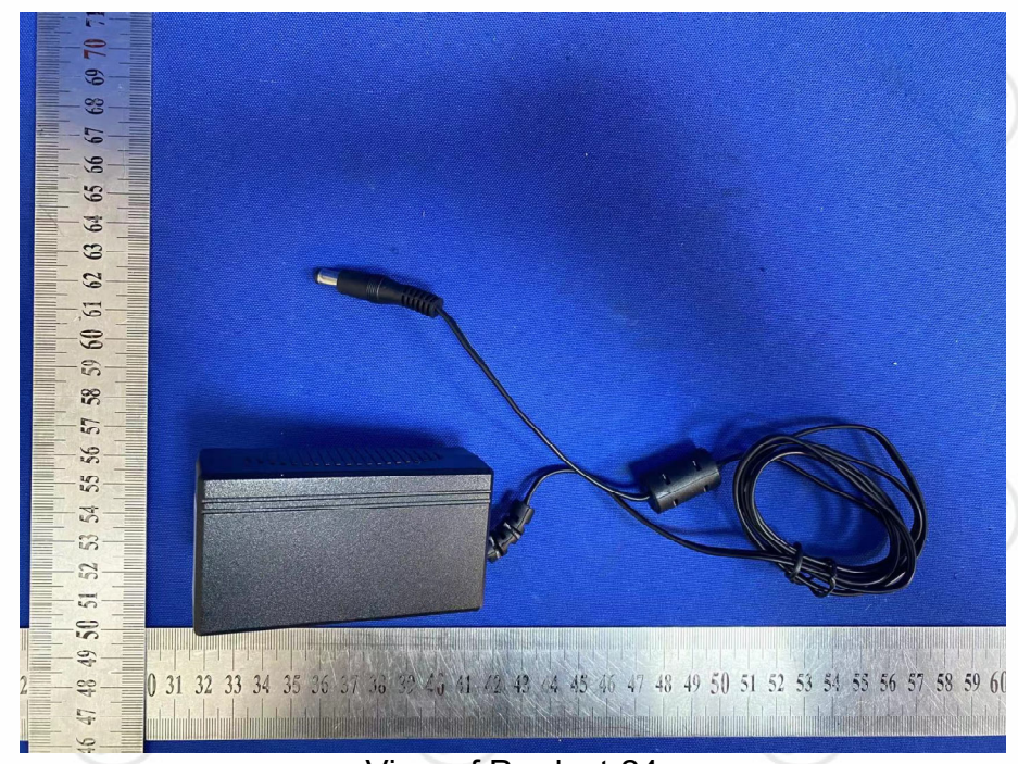
View of Product-24