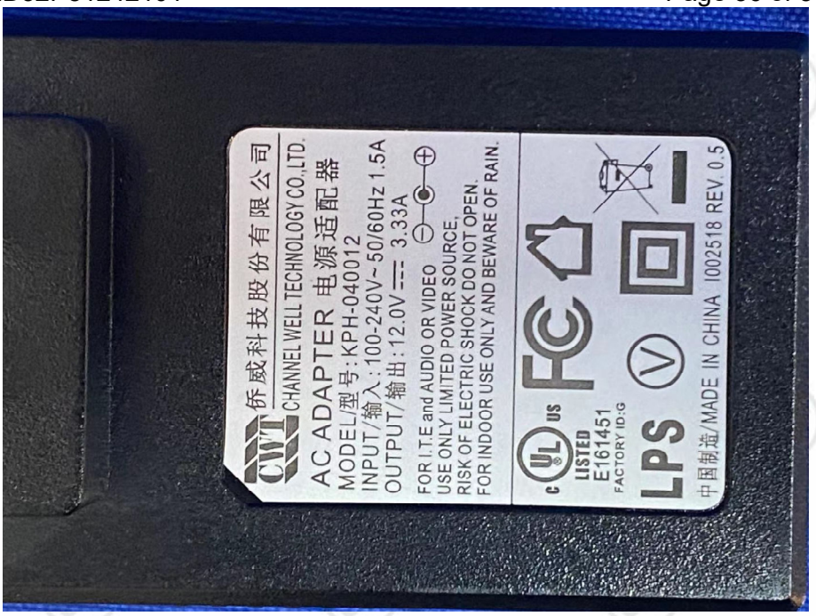
View of Product-19