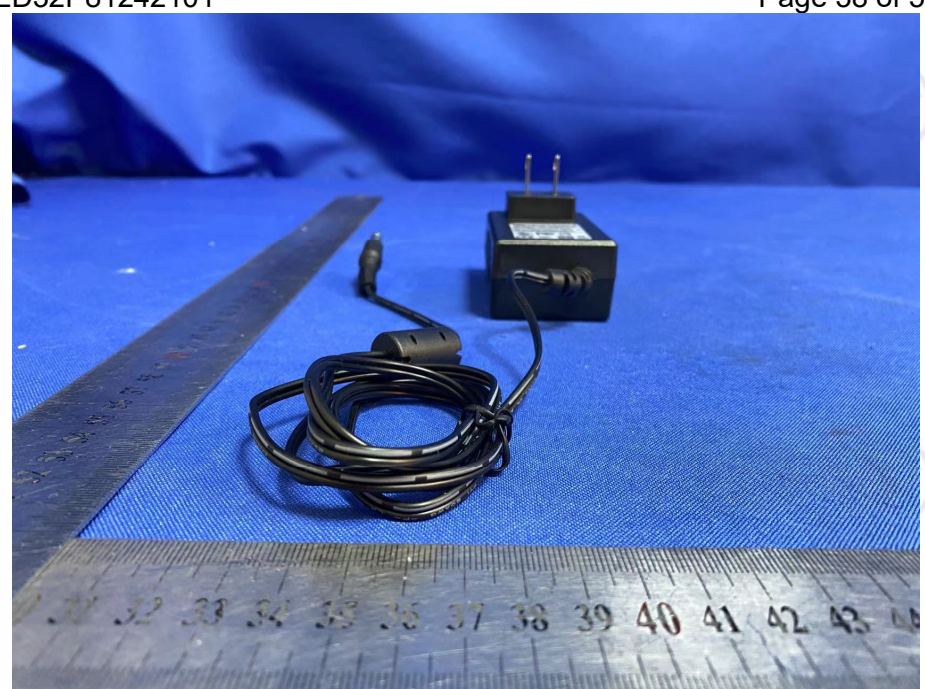
View of Product-23