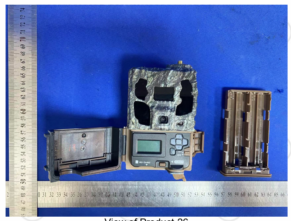
View of Product-26