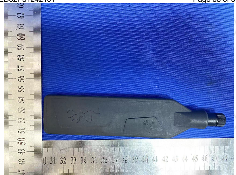
View of Product-17