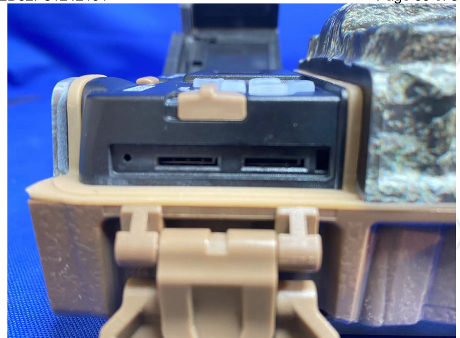
View of Product-25