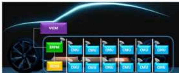
Picture 1. WBMS Architecture

The main function is to collect cell voltage and module temperature, and then transmit to BRFM by wireless communication.