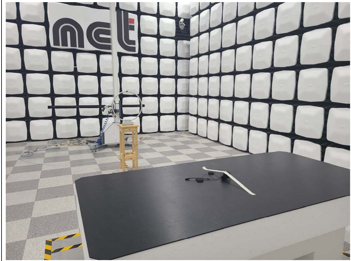
Below 30 MHz