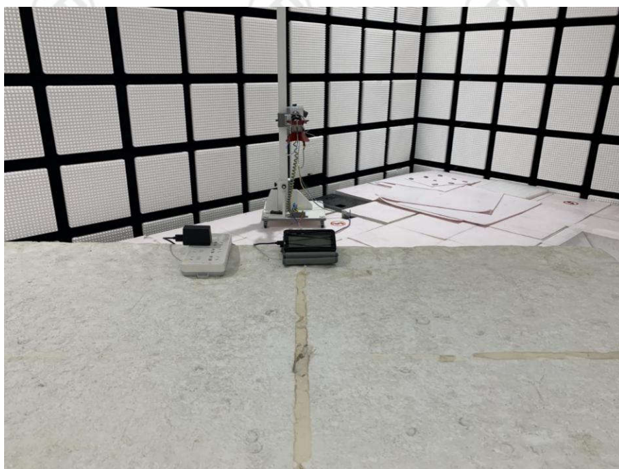
Radiated spurious emission Test Setup-2(Above 1GHz)