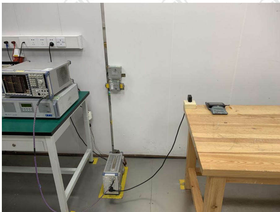
CONDUCTED EMISSION TEST SETUP