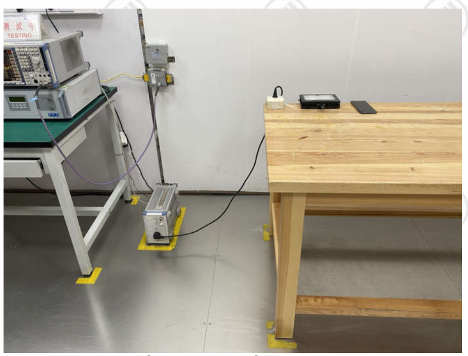
AC Power Line Conducted Emission Test Setup