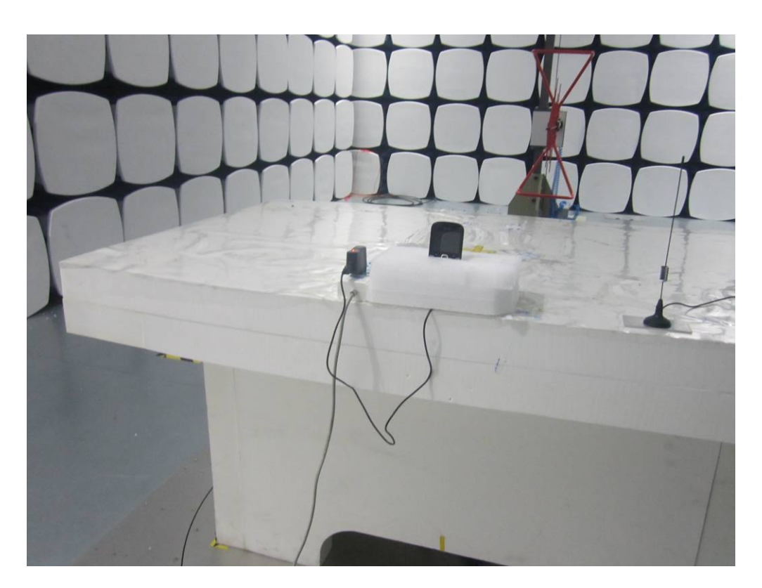
Radiated Spurious Emissions Test Setup Below 1GHz - Front View