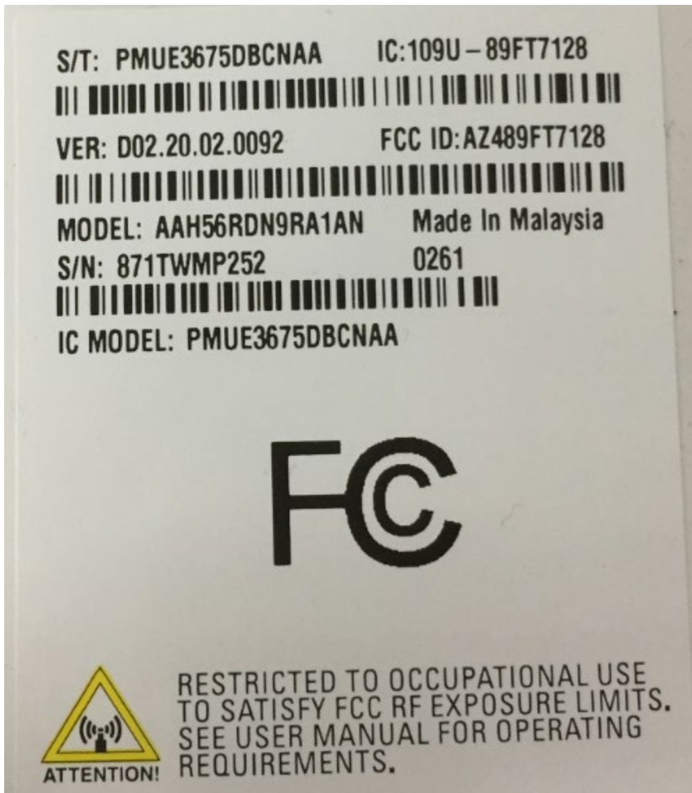
Figure 1A: Label for Full Keypad with Display Model (FKP) AAH56RDN9RA1AN / PMUE3675DBCNA