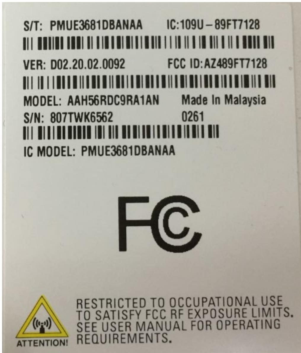
Figure 1C: Label for Non Keypad Model (NKP) AAH56RDC9RA1AN / PMUE3681DBANAA