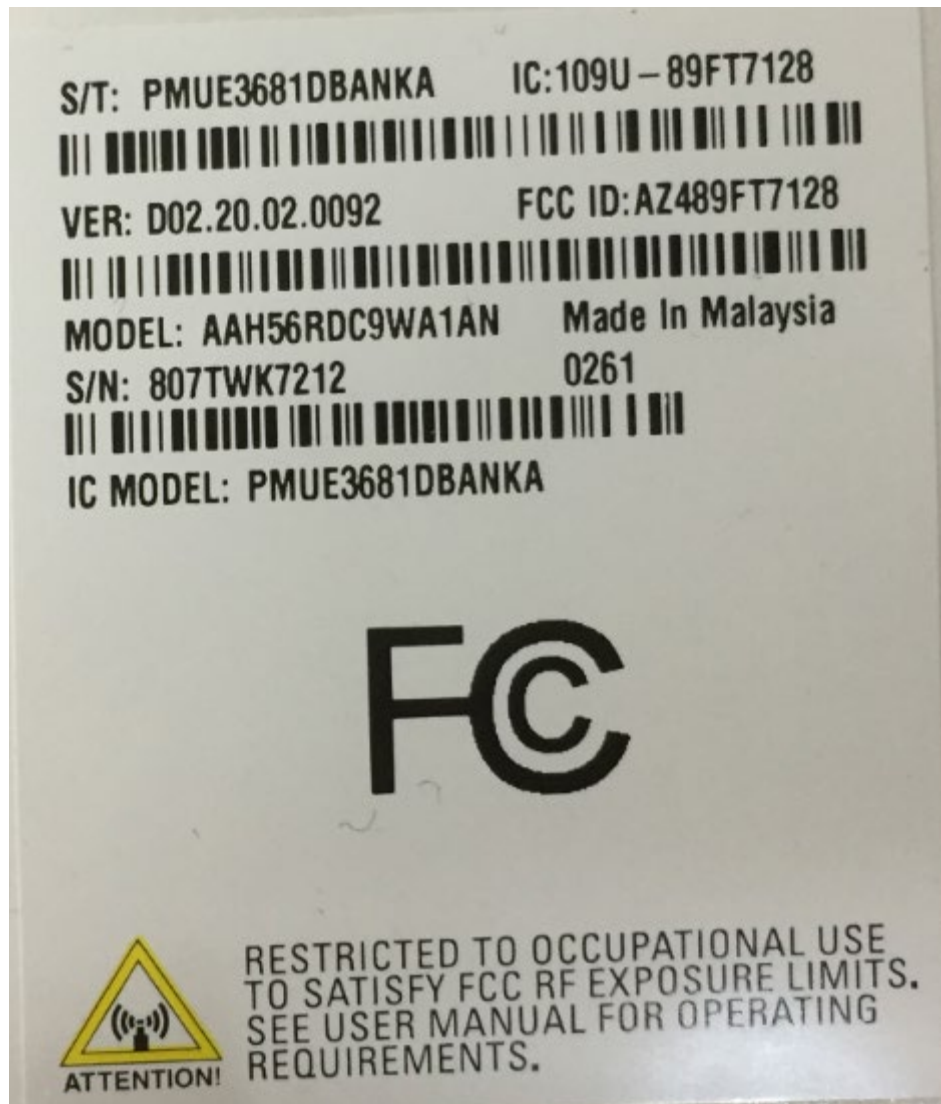
Figure 1D: Label for Non Keypad Model (NKP) AAH56RDC9WA1AN / PMUE3681DBANKA