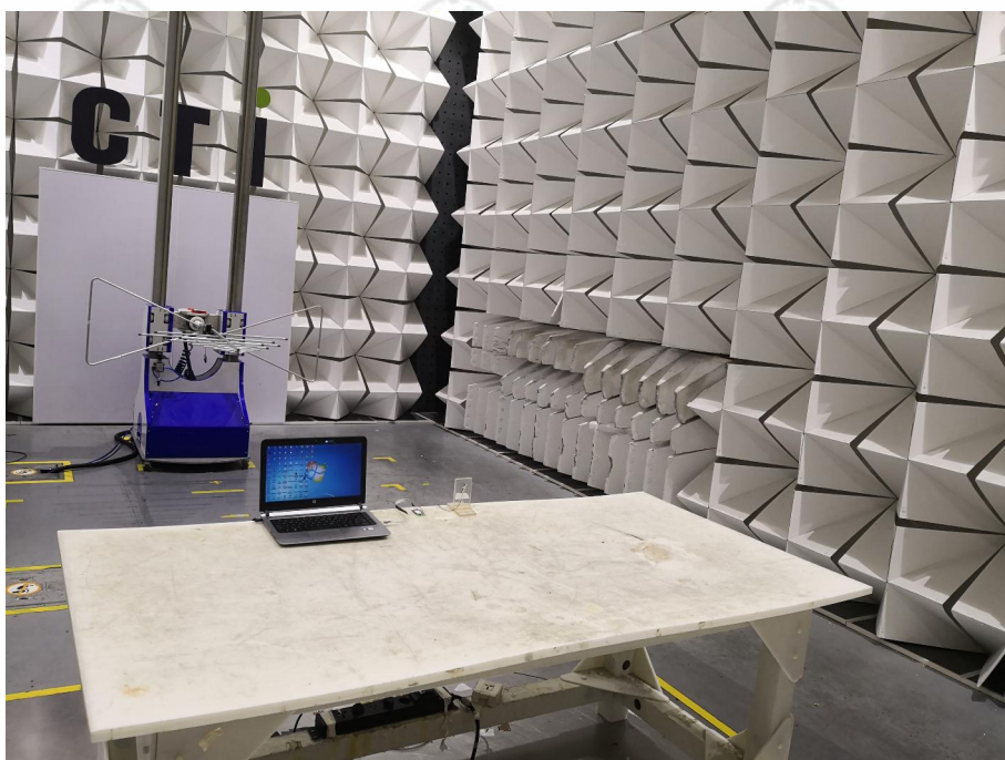
Radiated spurious emission Test Setup-2 (Below 1GHz)