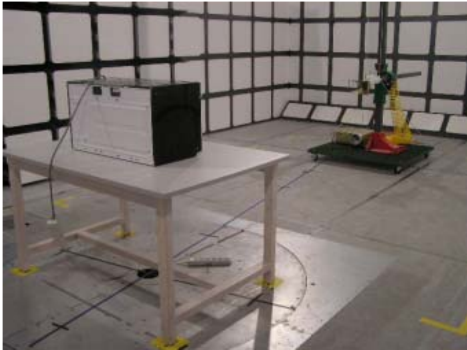
Above 1 GHz: Radiated Emission - Rear View