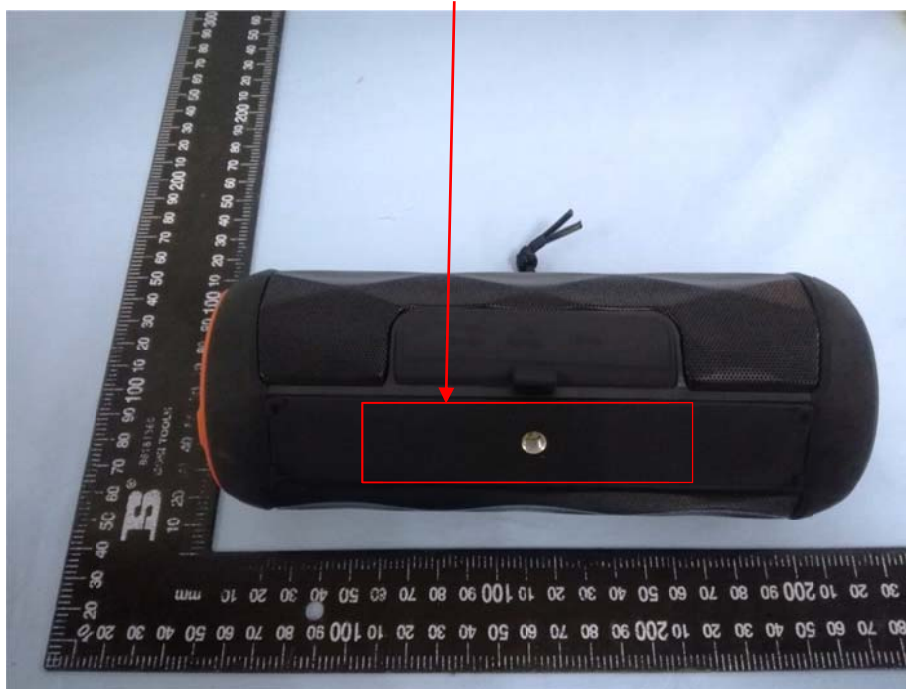
FCC ID Label Location