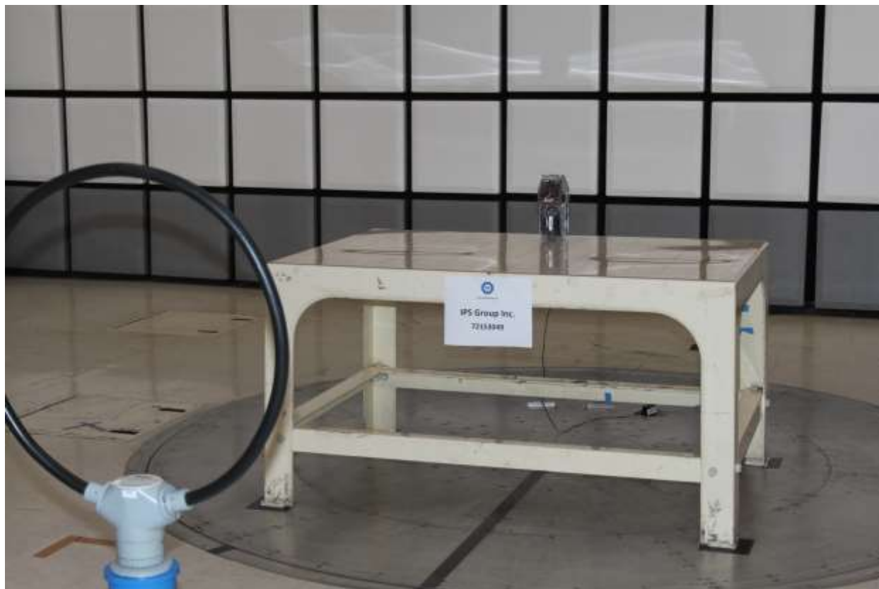
Radiated Emissions Test Setup (below 30MHz)