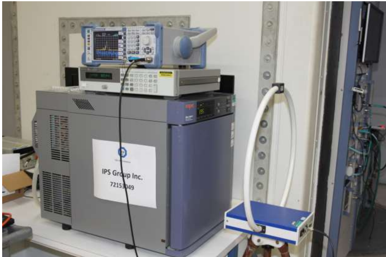
Frequency Stability/Voltage Variation Test Setup