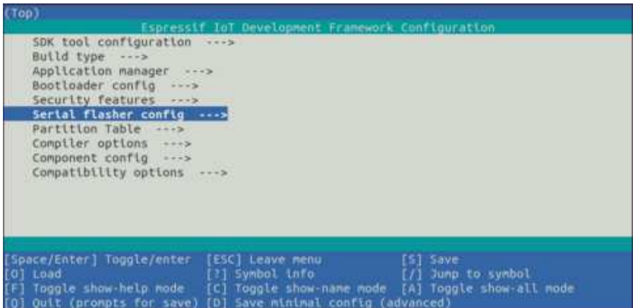
Figure 3: Project Configuration - Home Window

If the previous steps have been done correctly, the following menu appears: