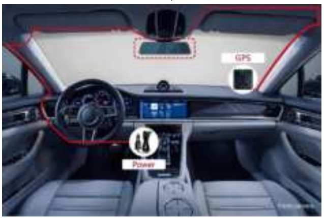
Power and GPS (optional and Taiwan only) wiring diagram

Fix the main unit on the rearview mirror with a rubber band, and plug the power cord into the Type-C port and the rear lens cable into the AV port.