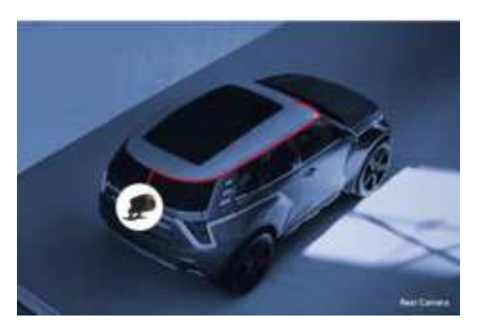
Rear lens wiring diagram Plug the power cord into the cigarette lighter, wait for about 15 seconds to complete the startup, and then start to operate.

Recommends you to wire and install by a professional if you are not familiar with car installation.