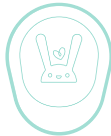
1 Soft Touch Sensor

Each Sensor's battery is designed to last around 3 months. You can view the status of the battery in the app.