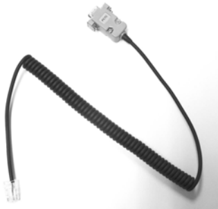
Transmitter Programming Cable PL-R50E2