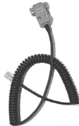
Receiver Programming Cable PL-R50E3

HYT endeavors to achieve the accuracy and completeness of this manual, but cannot guarantee its accuracy at all times. All the above specifications and design are subject to changes by HYT without prior notice.