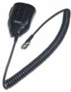
Remote Speaker Microphone SM-06R