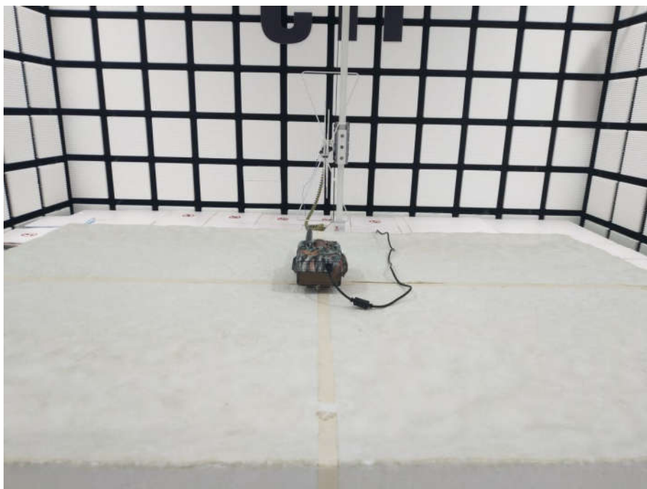
Radiated spurious emission Test Setup-1(Below 1GHz)