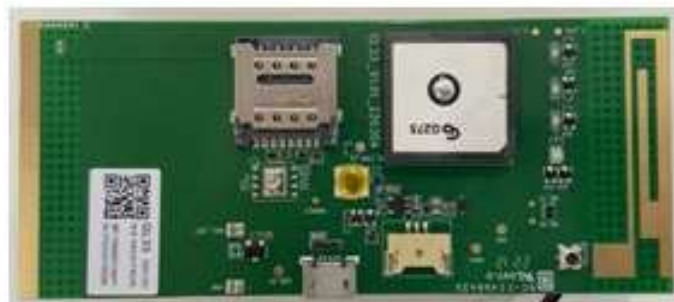
Figure 4. SIM Card Installation

Open the case and ensure the unit is not powered. Put the SIM card into the card holder, as shown below. Take care to align the cut mark. Close the SIM card holder. Close the case.