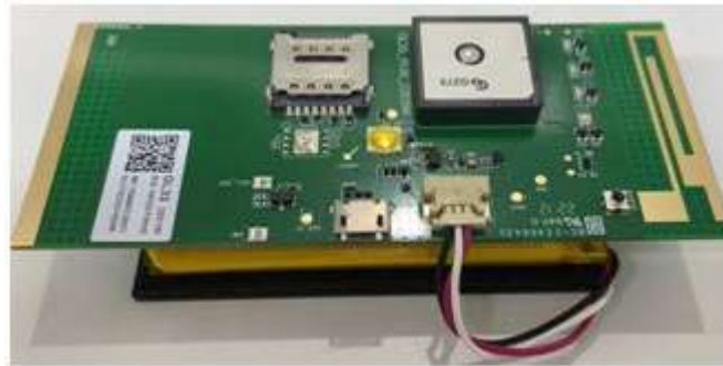
Figure 5. Backup Battery Installation

GL33 has an internal backup Li-ion battery (2800mAh).