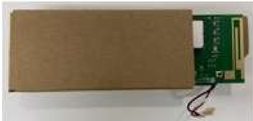
Figure 3. Open/Close the Case

To open the case, please open the designated right side of the box and take out the device.