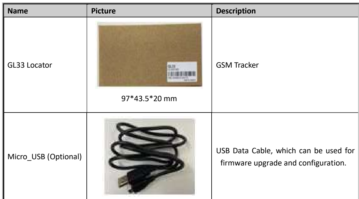
Table 3. Parts List