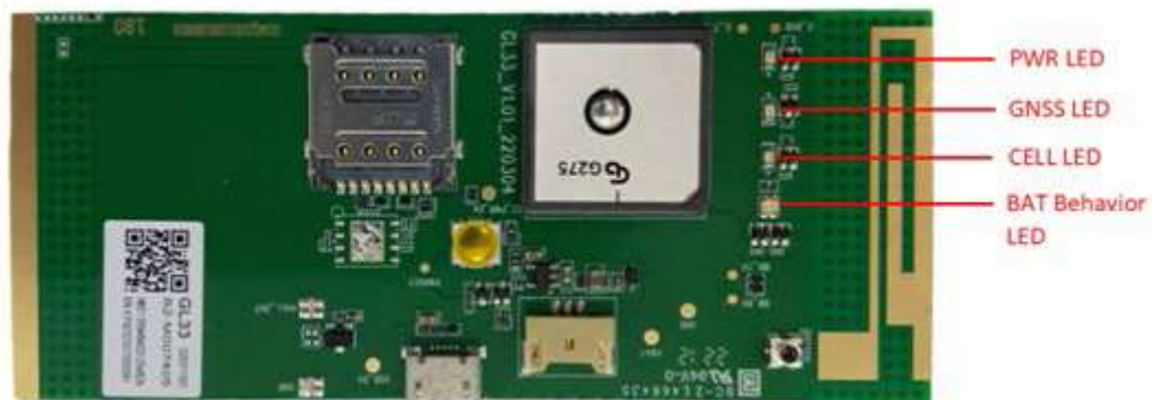
Figure 2. GL33 LEDs

There are four LEDs on GL33. For details, please see the table below.