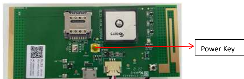
Figure 7. Power On GL33

Hold down the power key for 2 seconds, and the device will be powered on.