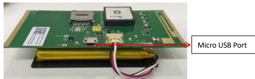
Figure 6. Typical Power Connection

You can configure GL33 with Micro USB cable according to your needs.