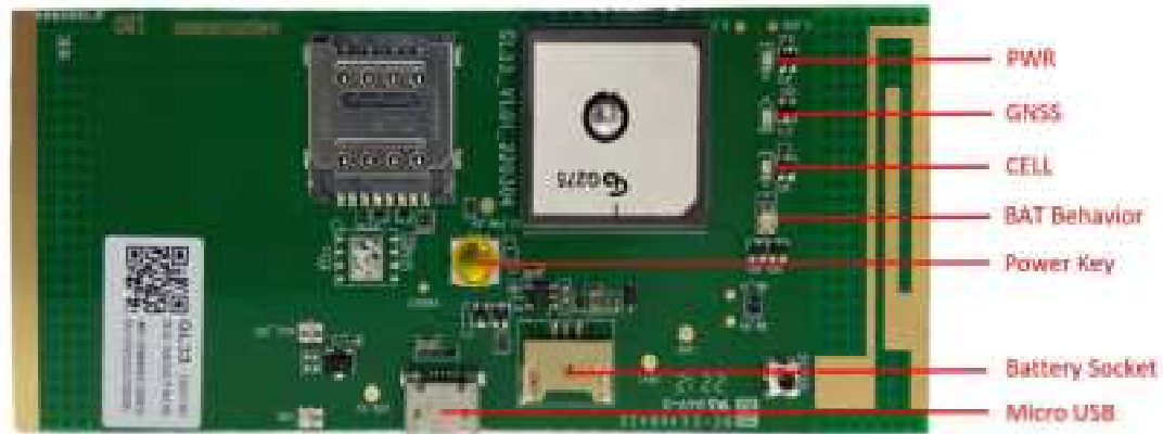
Figure 1. Appearance of GL33

Before starting, check whether all the following items have been included with your GL33. If anything is missing, please contact the supplier.