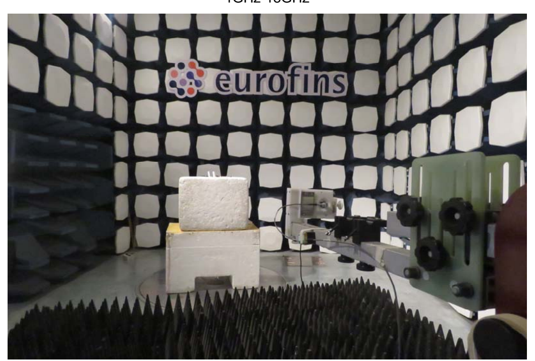
18GHz - 26.5GHz