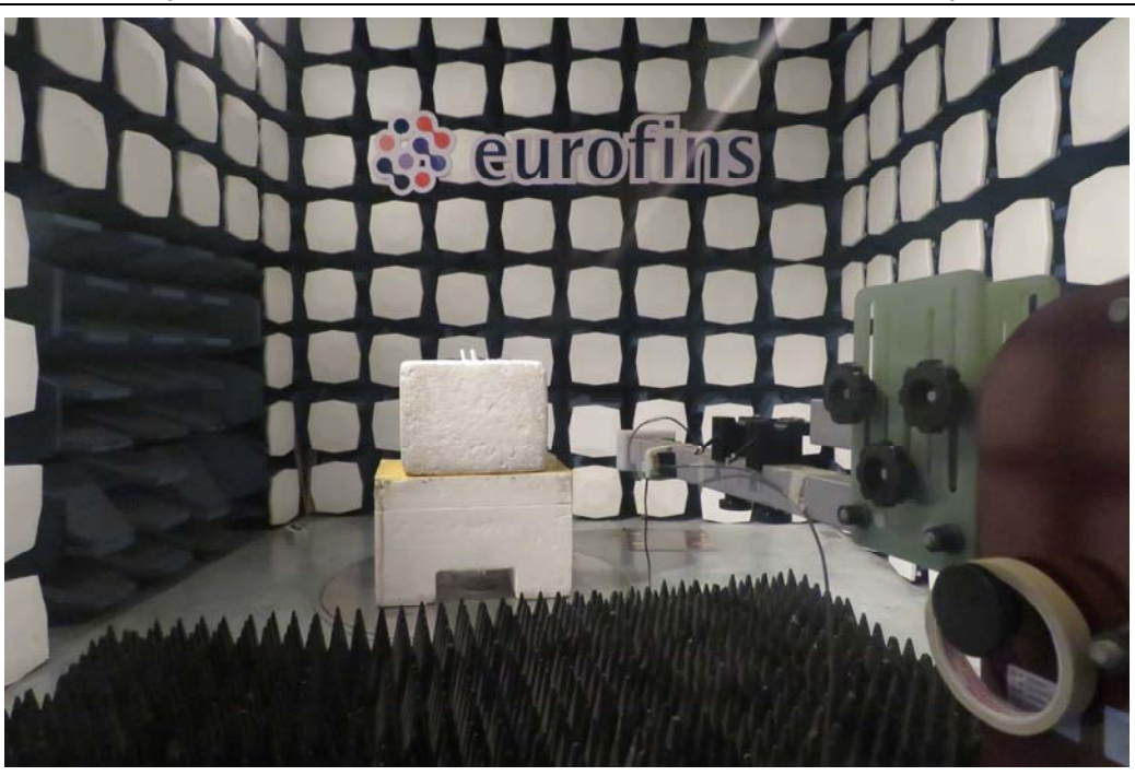
26.5GHz -40GHz Picture 1 Radiated Emission Test Setup