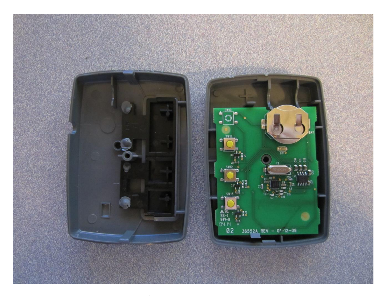
Figure 3: OCDFX5 Internal View / PCB Top