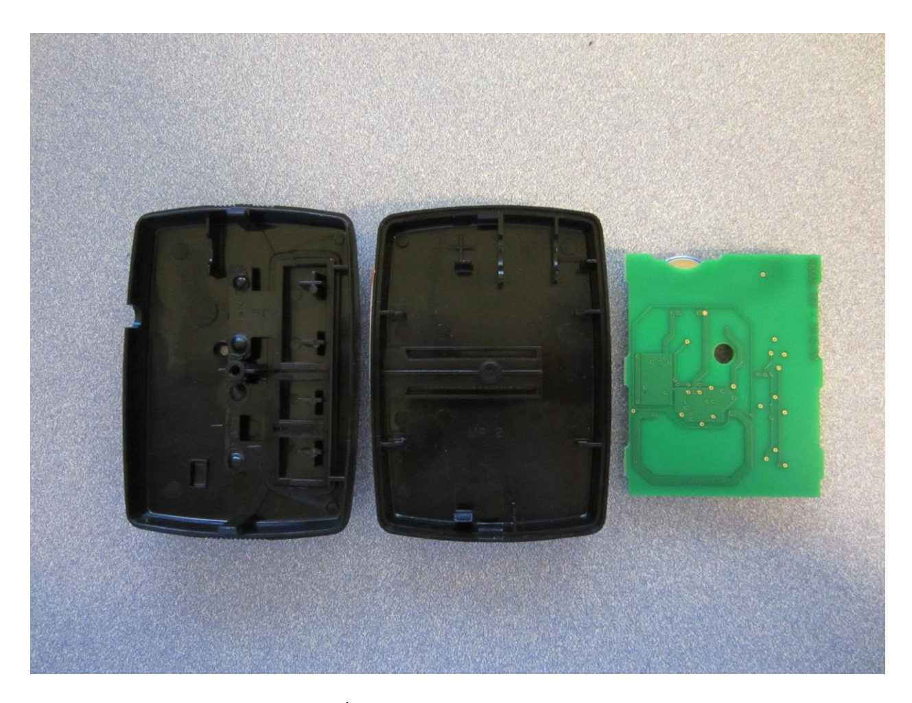
Figure 2: GIDFX5 Internal View / PCB Bottom