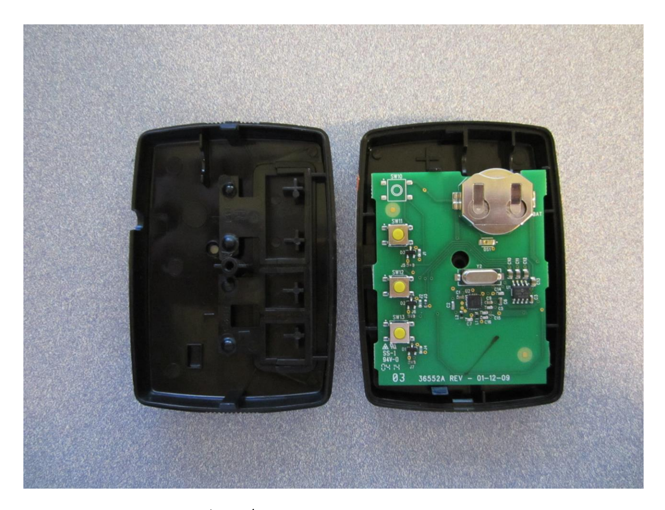
Figure 1: GIDFX5 Internal View / PCB Top