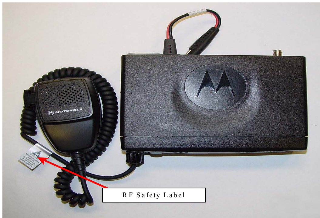
Figure 3-5: RF Safety Label Location attached at Microphone cord.