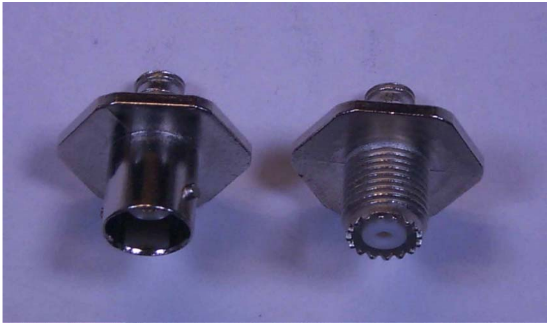
Figure 3-7: Antenna connector options, BNC on left, mini-UHF on right.