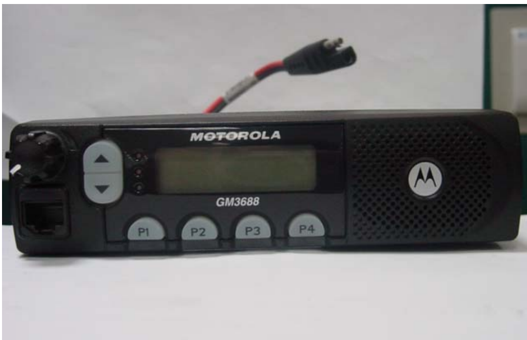
Figure 3-2: Front view of complete radio.