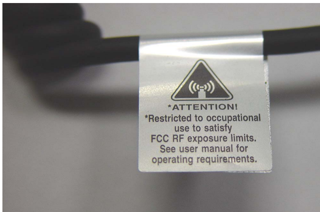
Figure 3-6: Close-Up of RF Safety Label