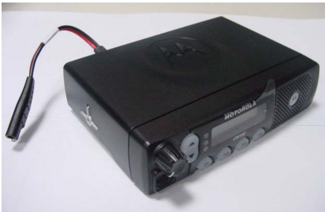
Figure 3-1: Front and side views of complete radio.