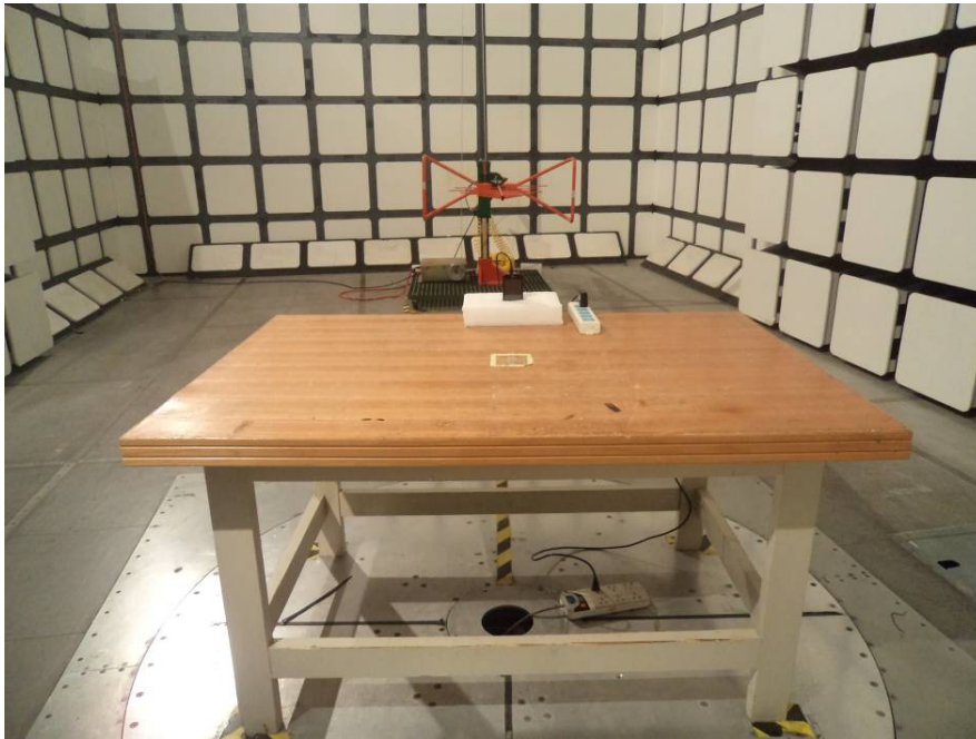
Radiated Emissions - Rear View (30-1000 MHz)