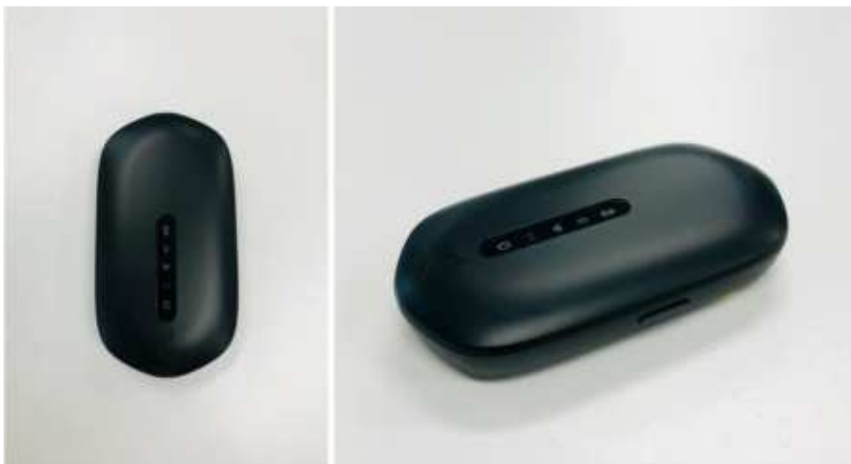
Figure 1. – Vector S7 wearable Device