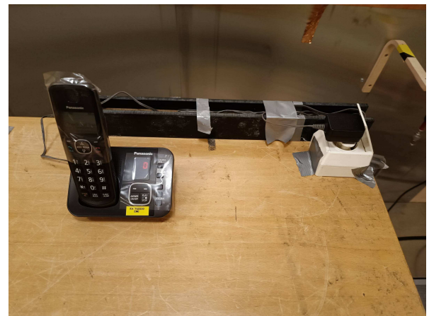
Power-Line Conducted Emissions