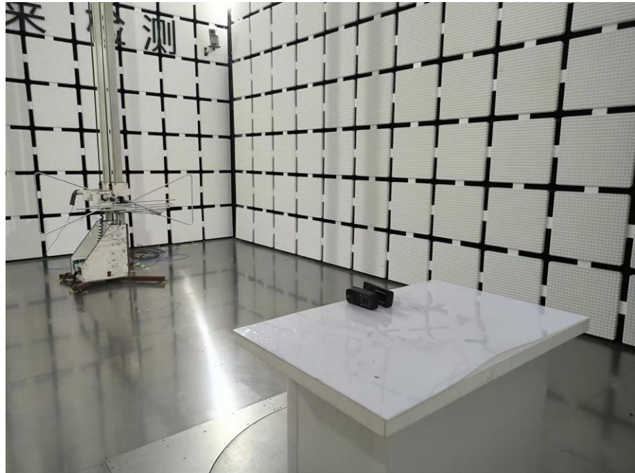
Radiated Measurement Photos