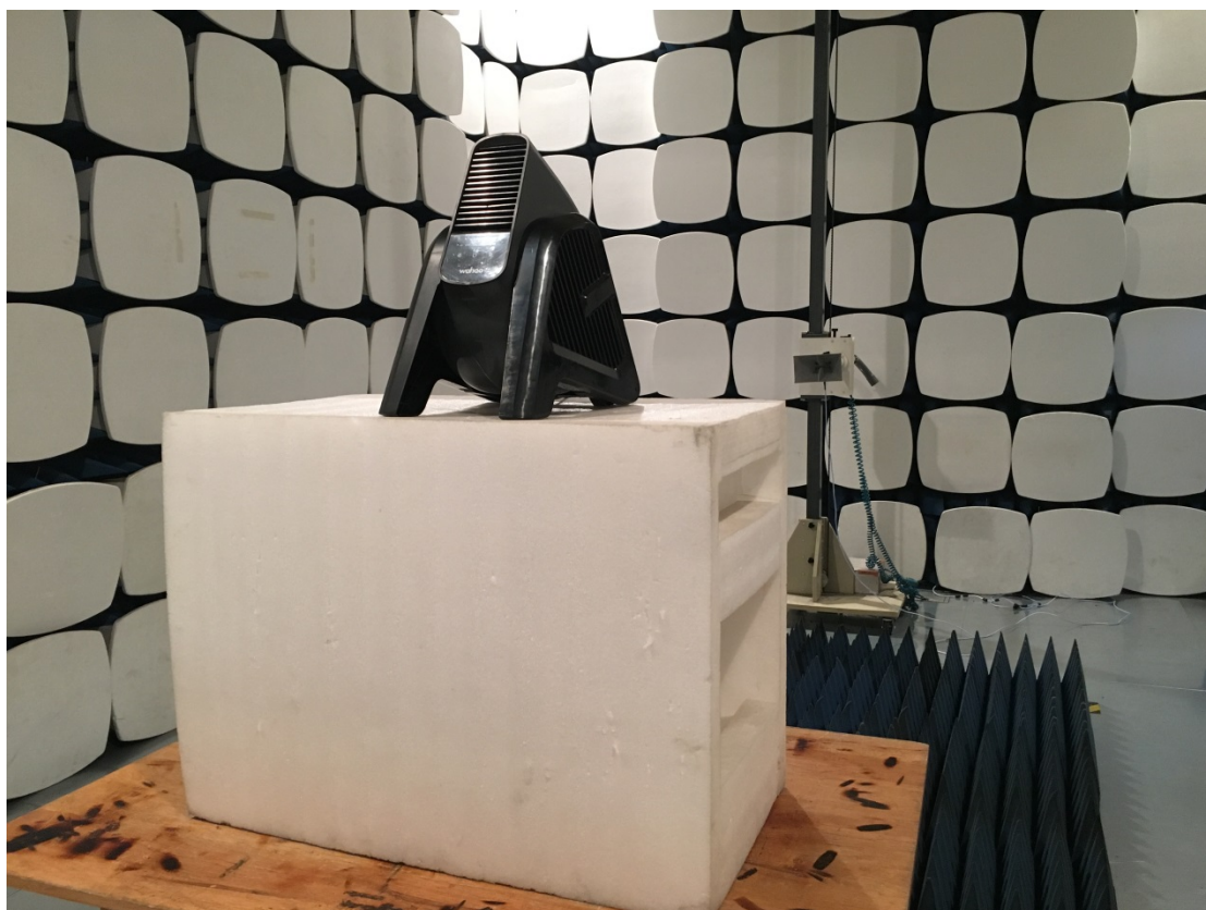
COMPLIANCE CERTIFICATION SERVICES (SHENZHEN) INC test above 1GHz emission