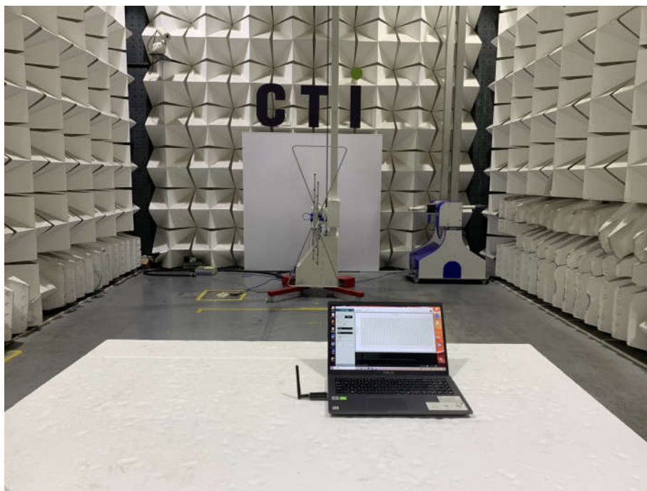
Radiated spurious emission Test Setup-1 (Below 1GHz)