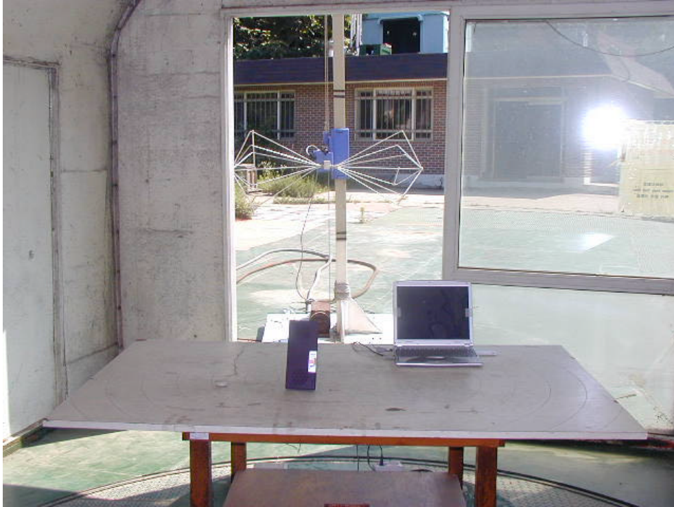
RADIATED EMISSION SETUP PHOTOGRAPH - FRONT VIEW ( 30 - 300 MHz )