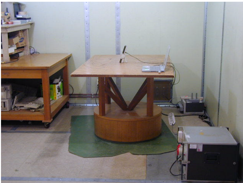
LINE CONDUCTED SETUP PHOTOGRAPH - REAR VIEW