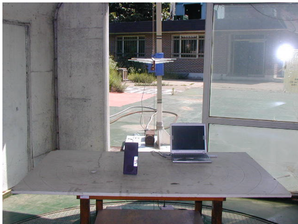
RADIATED EMISSION SETUP PHOTOGRAPH - FRONT VIEW ( 300- 1000 MHz )