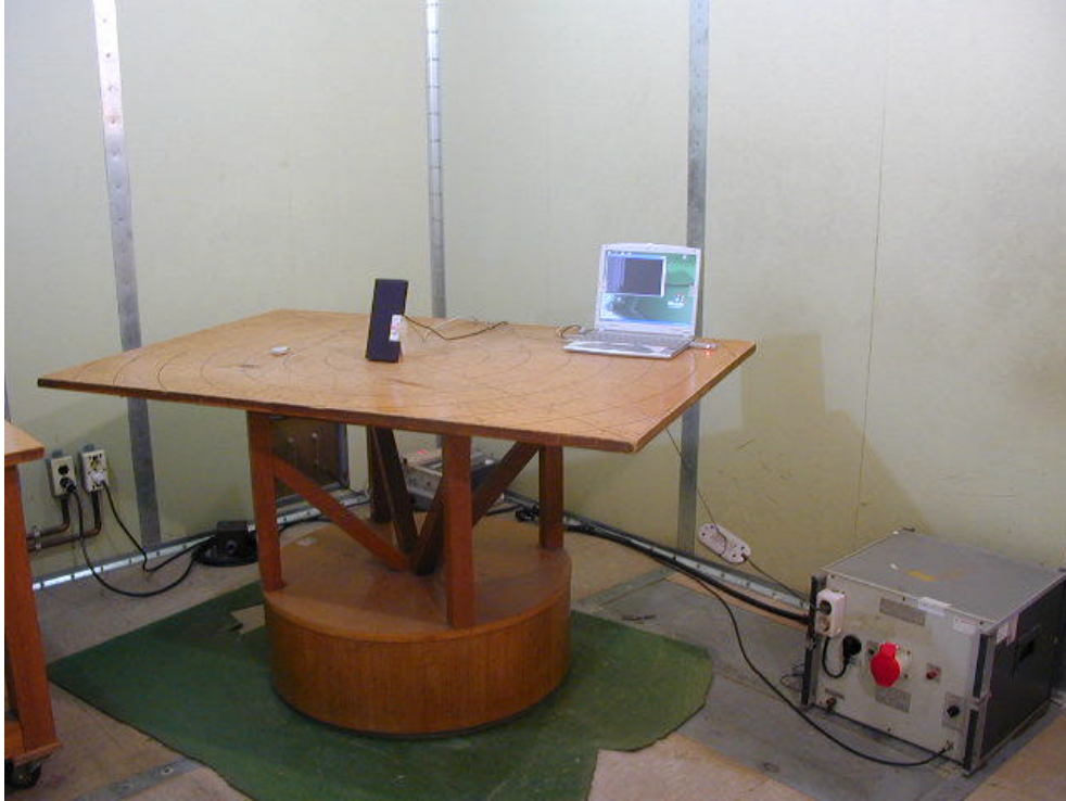
LINE CONDUCTED SETUP PHOTOGRAPH - FRONT VIEW