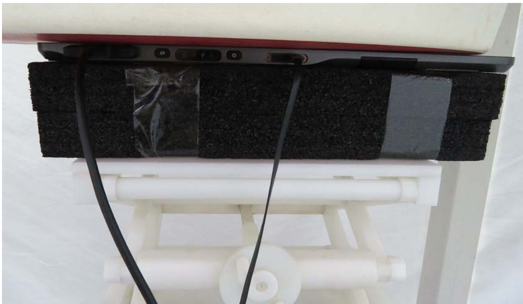
Picture 2: Front Side, the distance from handset to the bottom of the Phantom is 0mm (Scan 2)