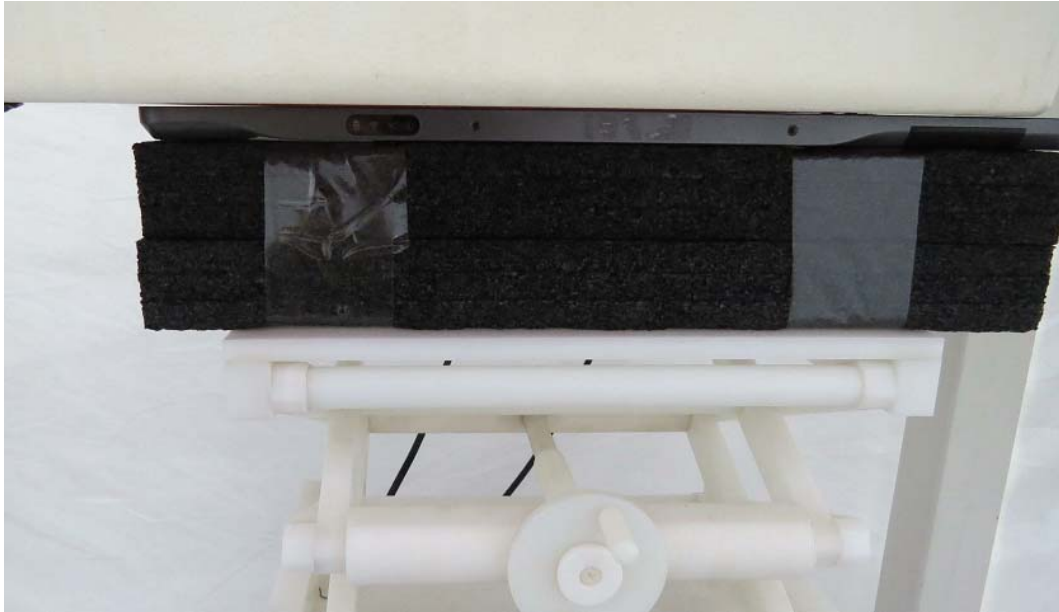
Picture 3: Front Side, the distance from handset to the bottom of the Phantom is 0mm (Scan 3)