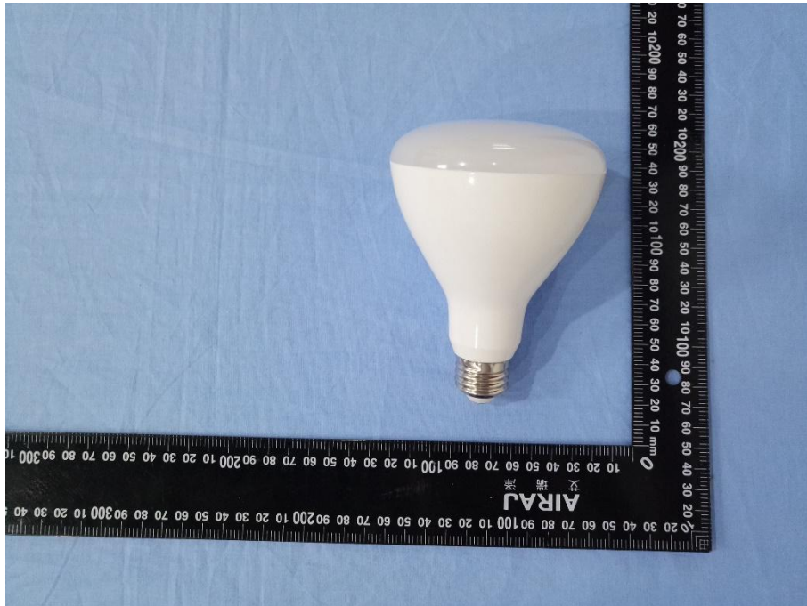
Lamp front view