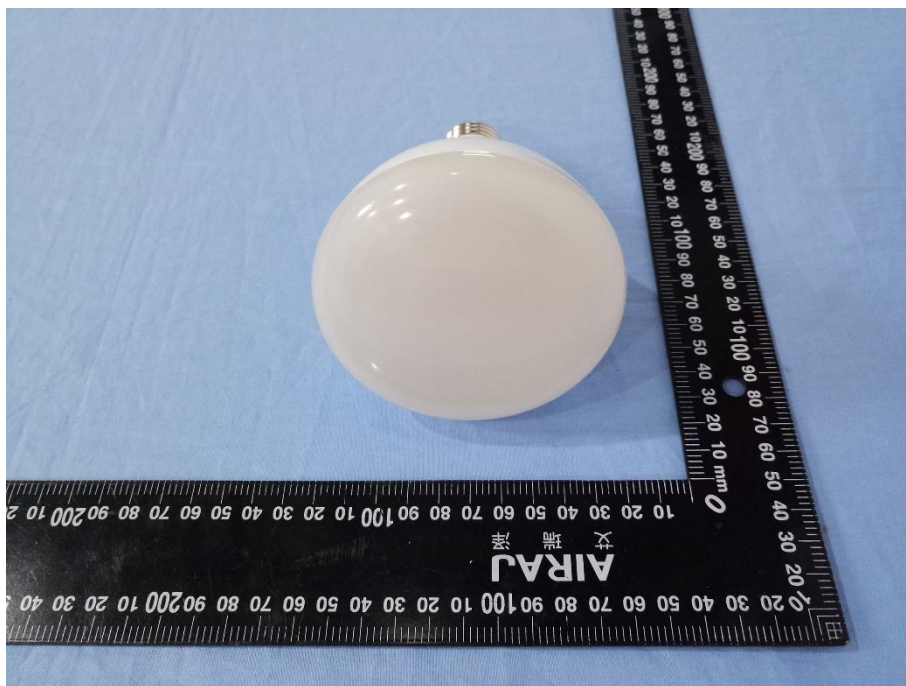
Lamp top side view

NOTE: 1.The report is invalid when there is no the approver signature and the special stamp for test report. 2.The test report shall not be reproduced except in full without prior written permission of the company. 3.The report copy is invalid when there is no the special stamp for test report. 4.The altered report is invalid. 5.The entrust test is responsibility for the received sample only.