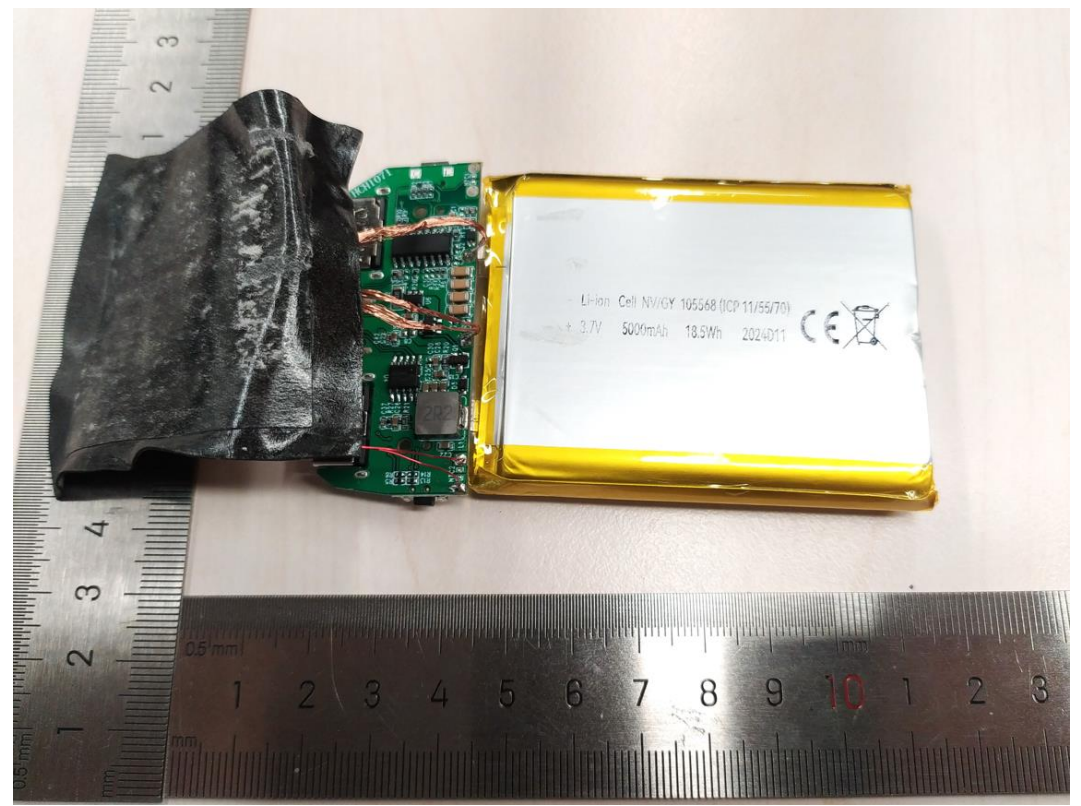
Figure 8 Internal view