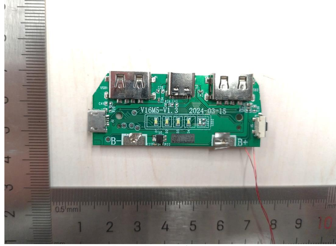
Figure 9 Top view of mainboard