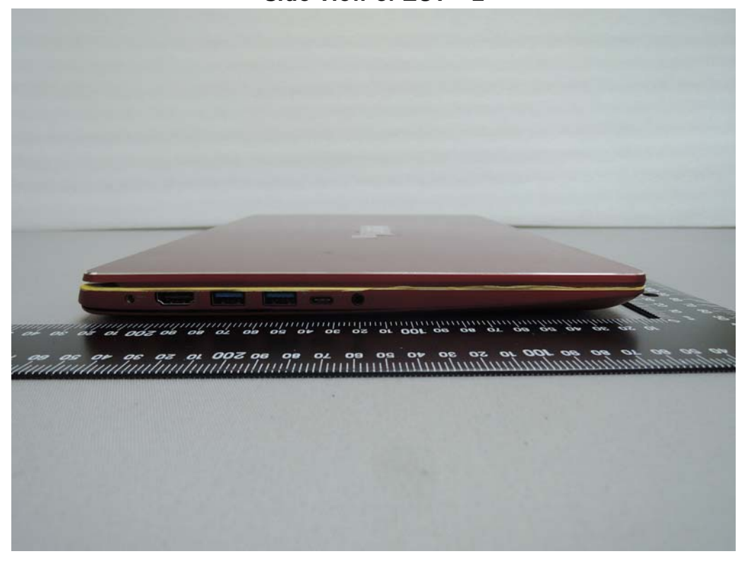
Side View of EUT - 3