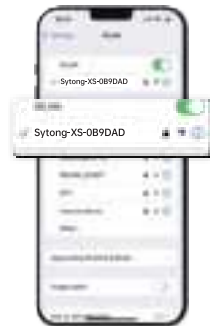
choose WiFi "Sytong ..." to connect WiFi (password: 12345678 )