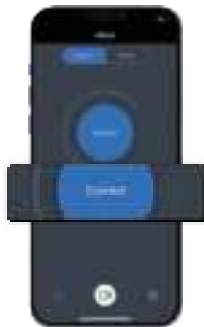
Enter into APP