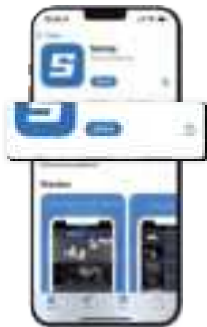
Download the APP

Download APP by Scanning the QR code according to the mobile phone system.