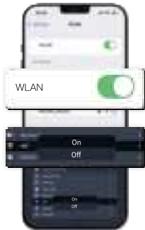
Turn on WiFi on XS and phone