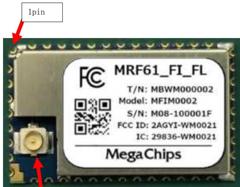
Picture 3-1 MRF61_FI_FL Top view