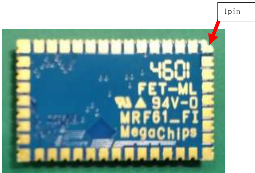
Picture 3-3 MRF61_FI_F1/TH Bottom view