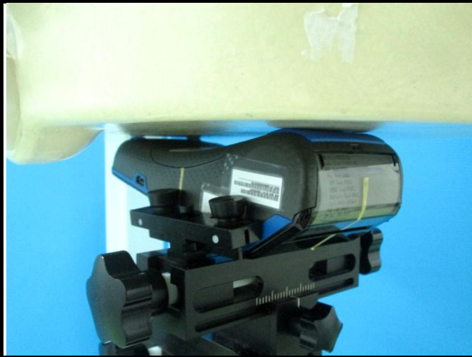
Rear Face of EUT with 0 cm Gap (Formal Testing on Flat Phantom)