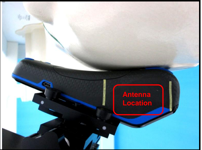
Rear Face of EUT with 0 cm Gap (Verified Testing on Curved Phantom)