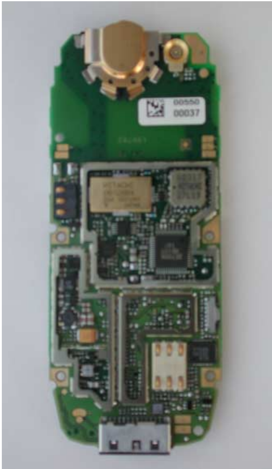
S56 Board without shielding, side 2