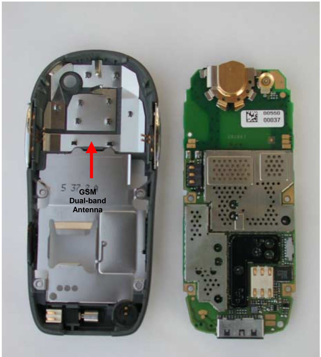
S56 Disassembly step 2: GSM Dual-band Antenna