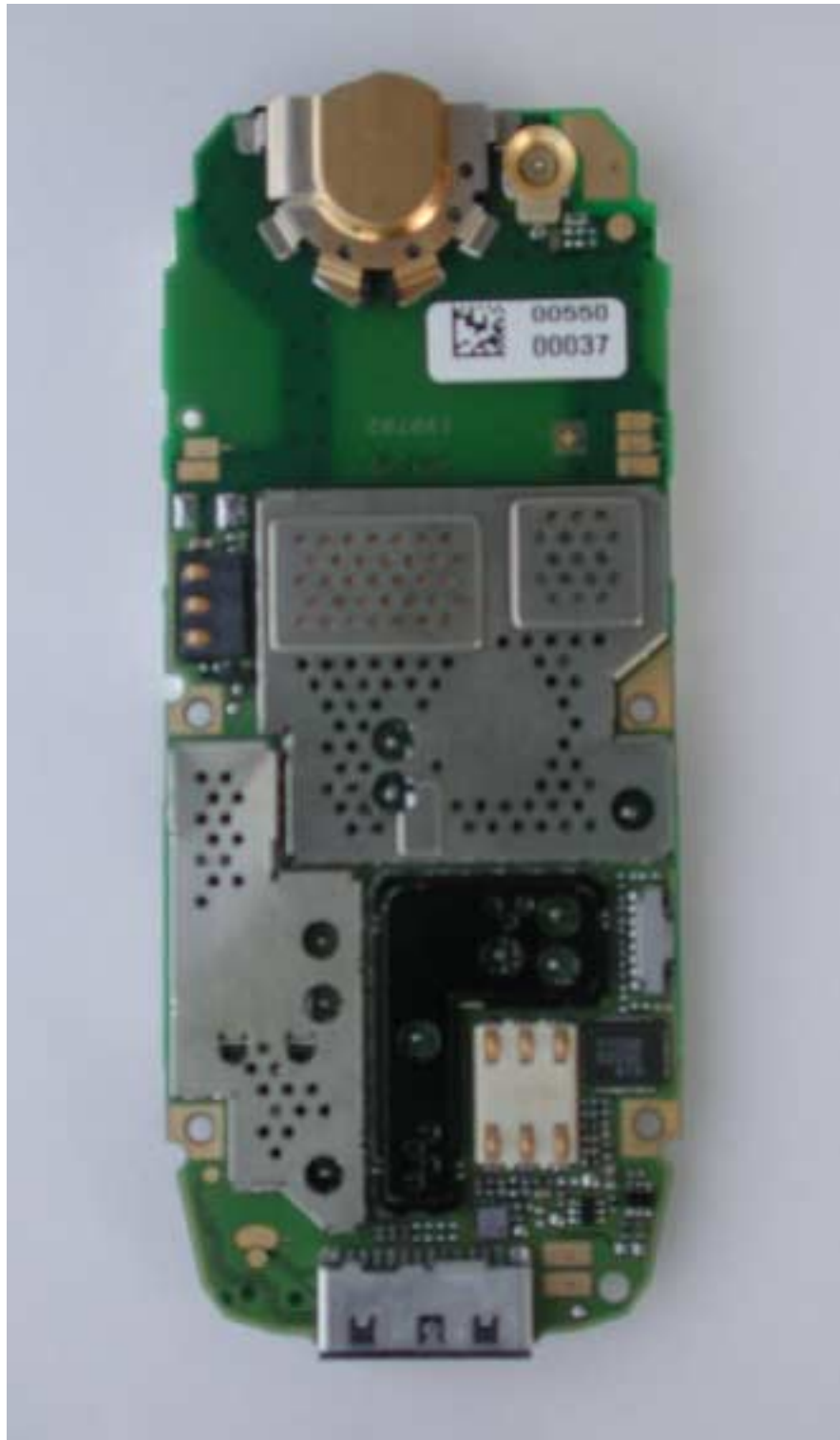
S56 Board with shielding, side 2