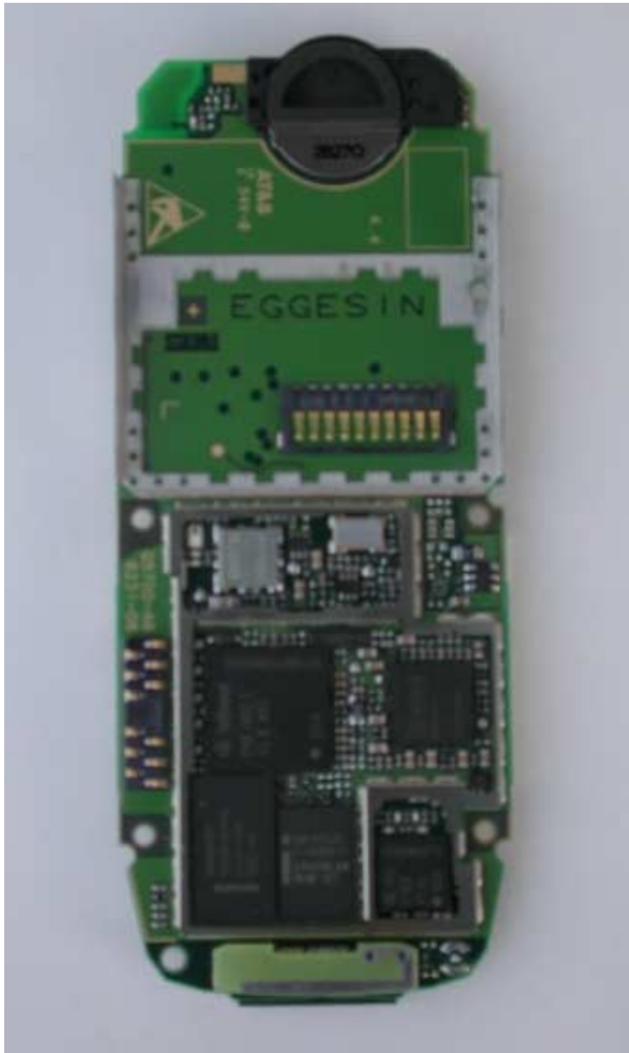
S56 Board without shielding and without display, side 1