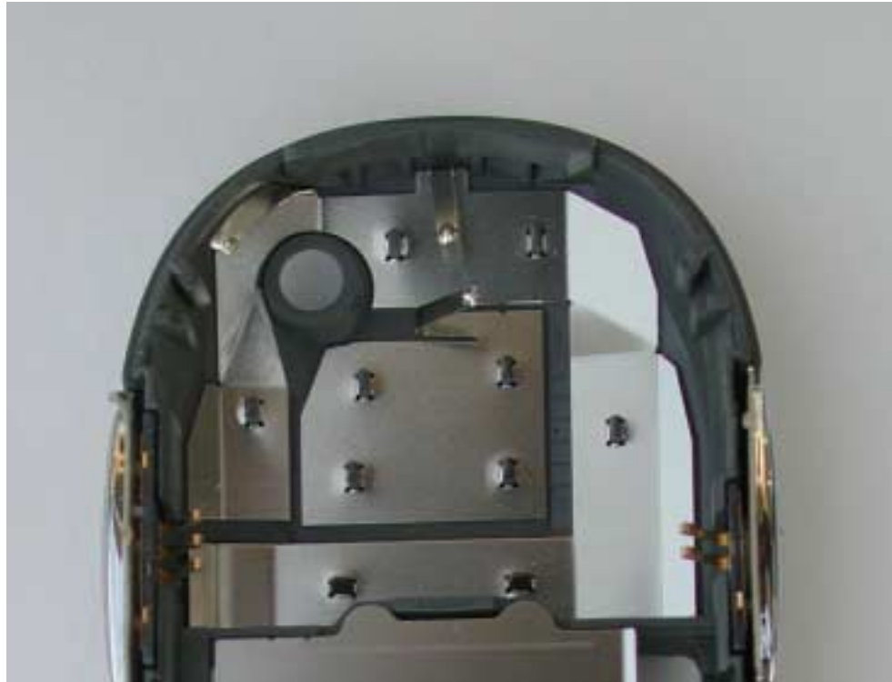
GSM Dual-band Antenna