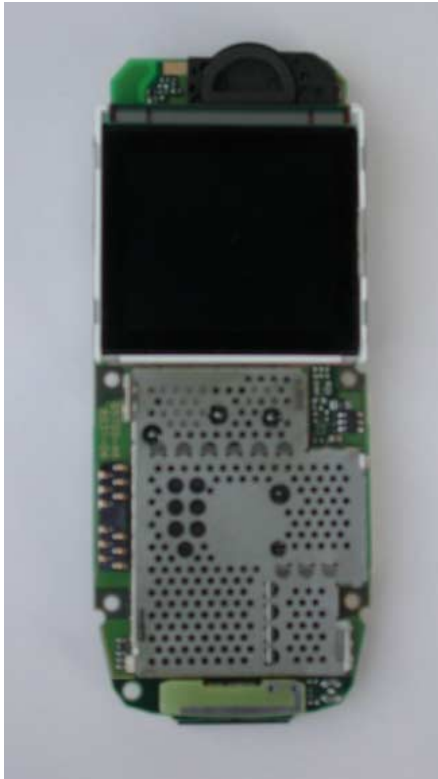
S56 Board with shielding, side 1