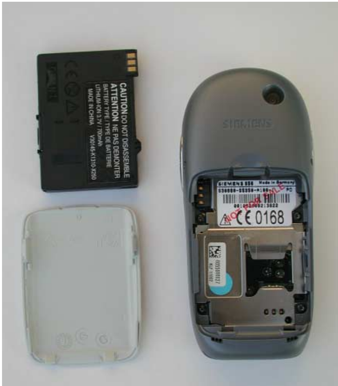
S56 Open battery cover (Final label: see extra exhibit)