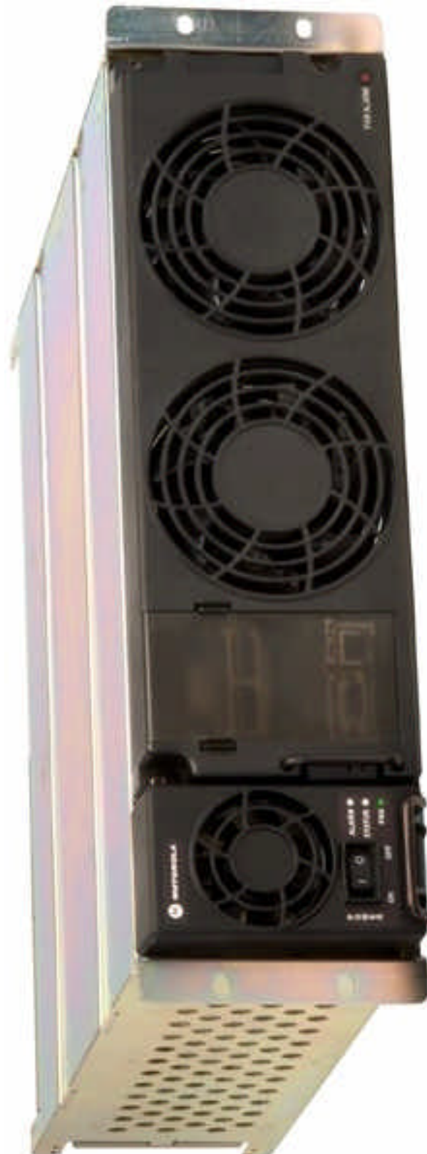
External Front View of Base Radio