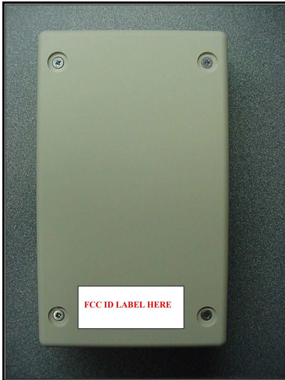
PHOTOGRAPH 2: LOCATION OF LABEL ON DEVICE

Please refer to the following page for the FCC ID label sample.