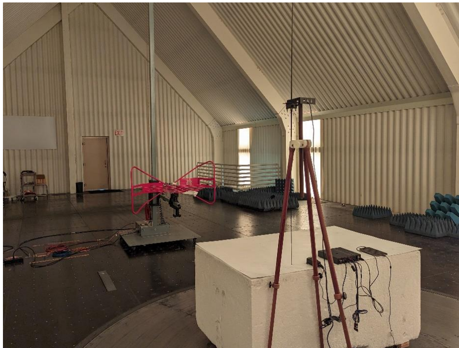
Photograph 2: Back View Radiated Emissions Worst Case 30 MHz to 1000 Configuration