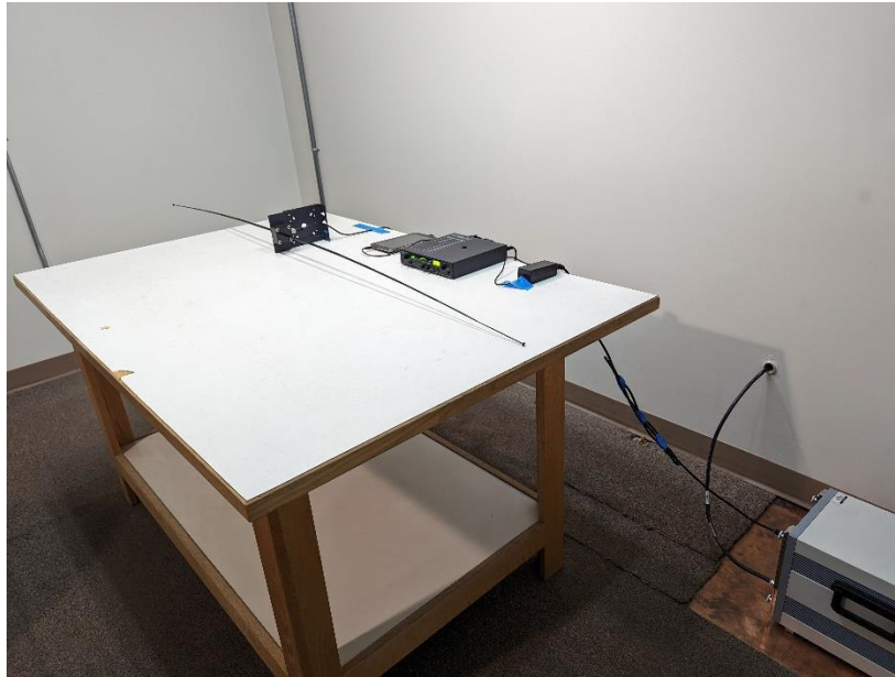
Photograph 3: Front View Conducted Emissions Worst-Case Configuration