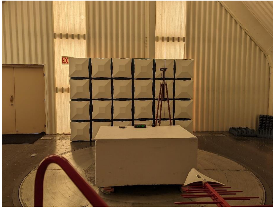
Photograph 1: Front View Radiated Emissions, Worst Case – Below 1000 MHz Configuration