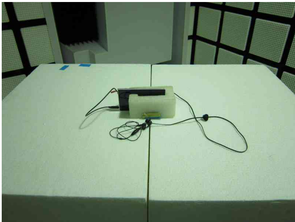
– Y-axis –