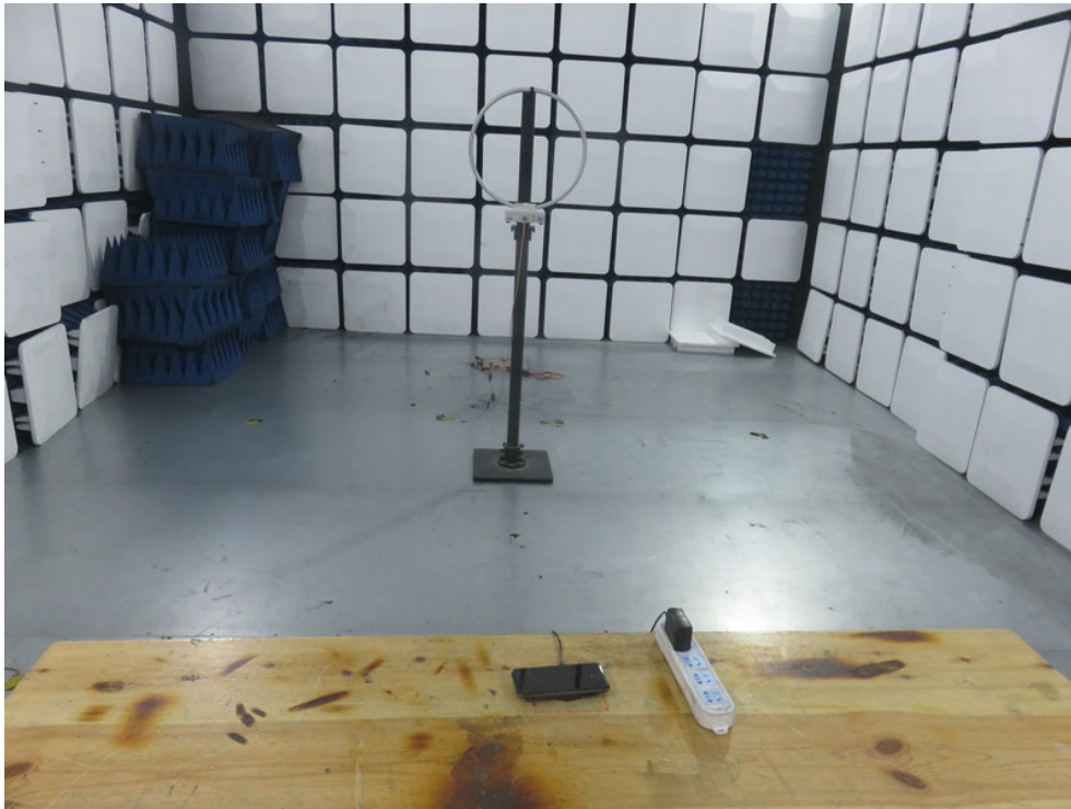
Photo of MPE Measurement