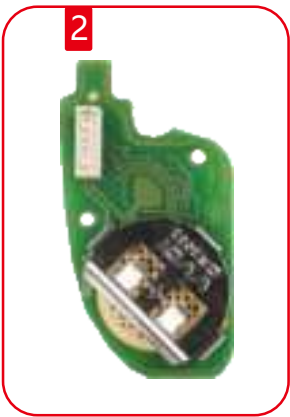
Take the battery out and replace new one

Note: The battery type is 2032 with 3V, ensure the positive and negative of battery is correct.