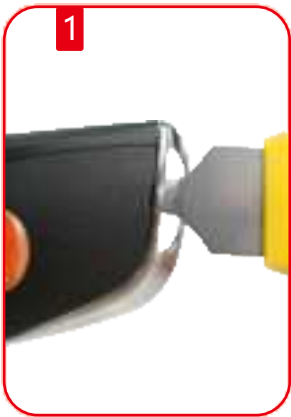
Just pry the plastic cover upward

First use or when the battery runs out need to change new battery, following steps: