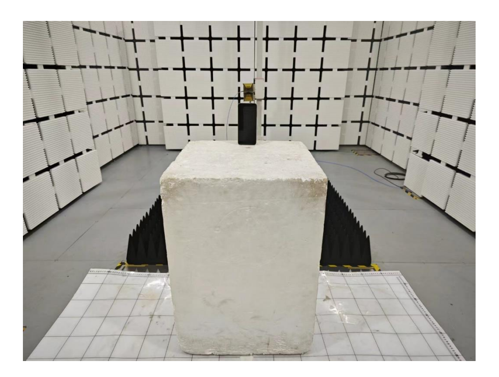
Set-up for Radiated Spurious Emission, Above 1GHz