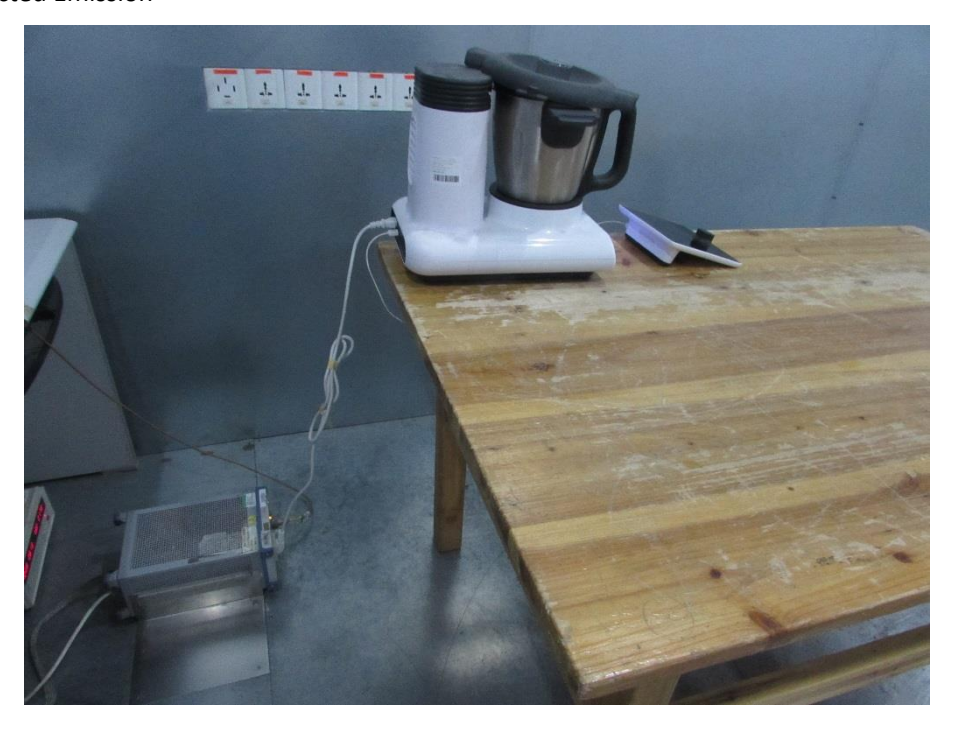
Radiated Emission (Below 1GHz)