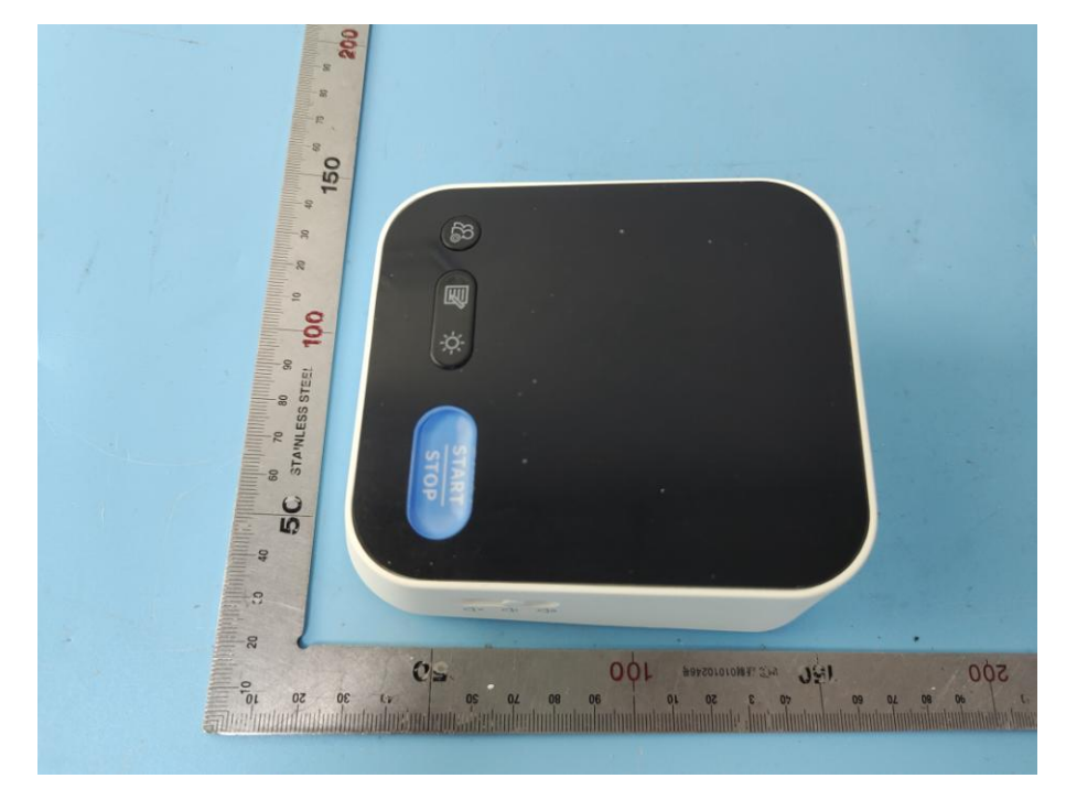
FRONT VIEW OF SAMPLE