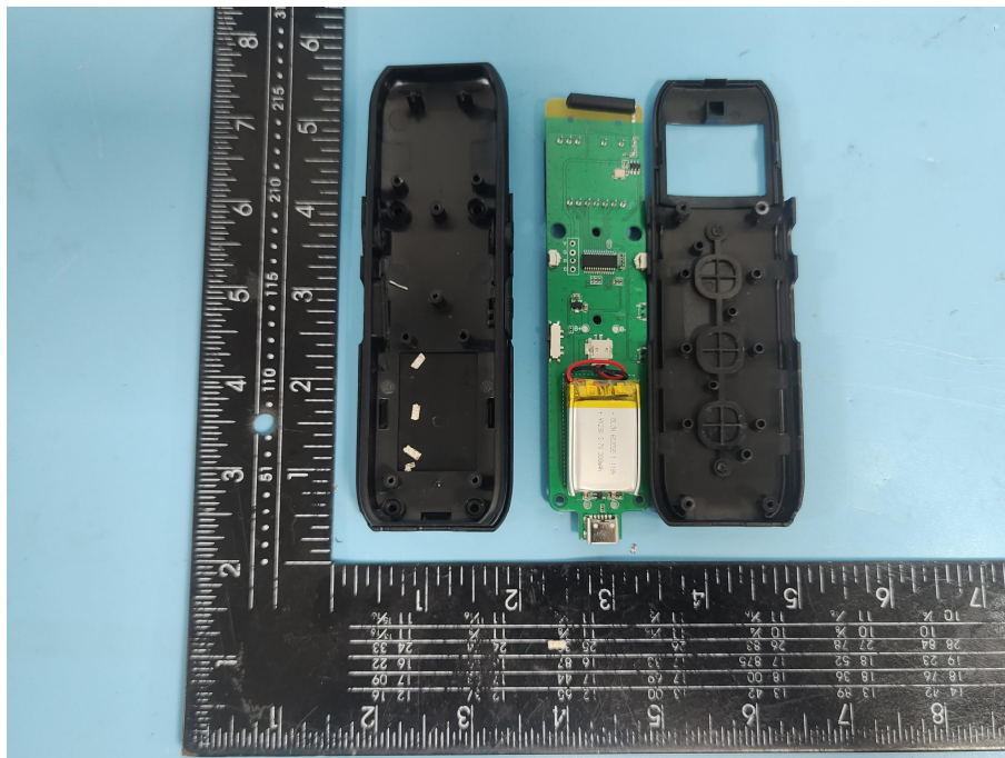
INTERNAL PHOTO OF SAMPLE PCB