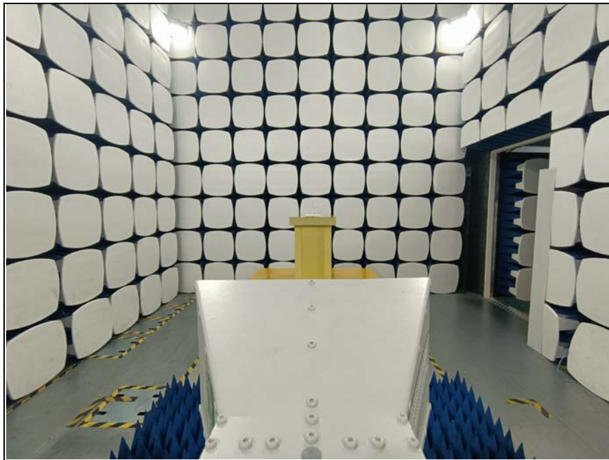
1GHz to 18GHz