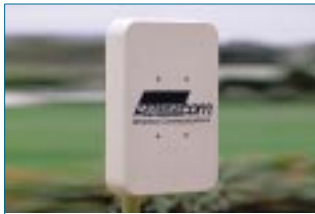
Uni-11P-75 & Uni-13P