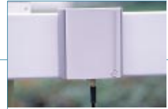
Uni-8.5 & Uni-8.5Ext