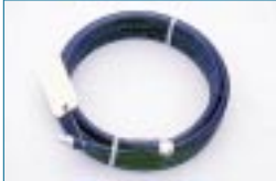
EXT-10 thru EXT-200